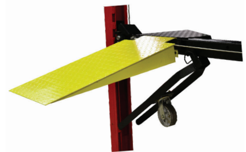
Removable Ramps + Caster Wheels