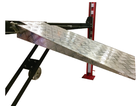
Lightweight Aluminum Ramps