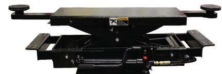
3,500 lb. (1.6T) Sliding Scissor Jack